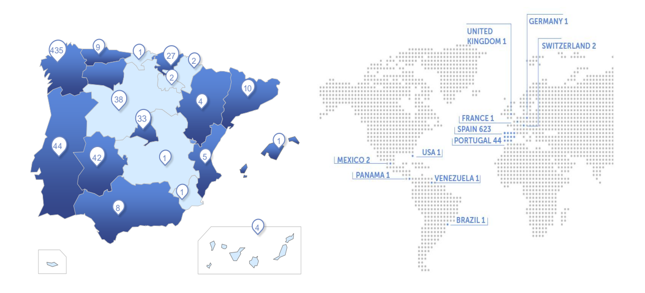
*Mexico includes Sentir Común SOFOM (Sociedad Financiera de Objeto Múltiple).

In addition, the presence of ABANCA in the Iberian market is complemented by a presence in the international markets through two operational branches in Switzerland and Miami (as of 31 December 2022) and representative offices (France, the UK, Switzerland, Germany, Panama, Brazil, Mexico and Venezuela). Please also see "— History and development – History " above.