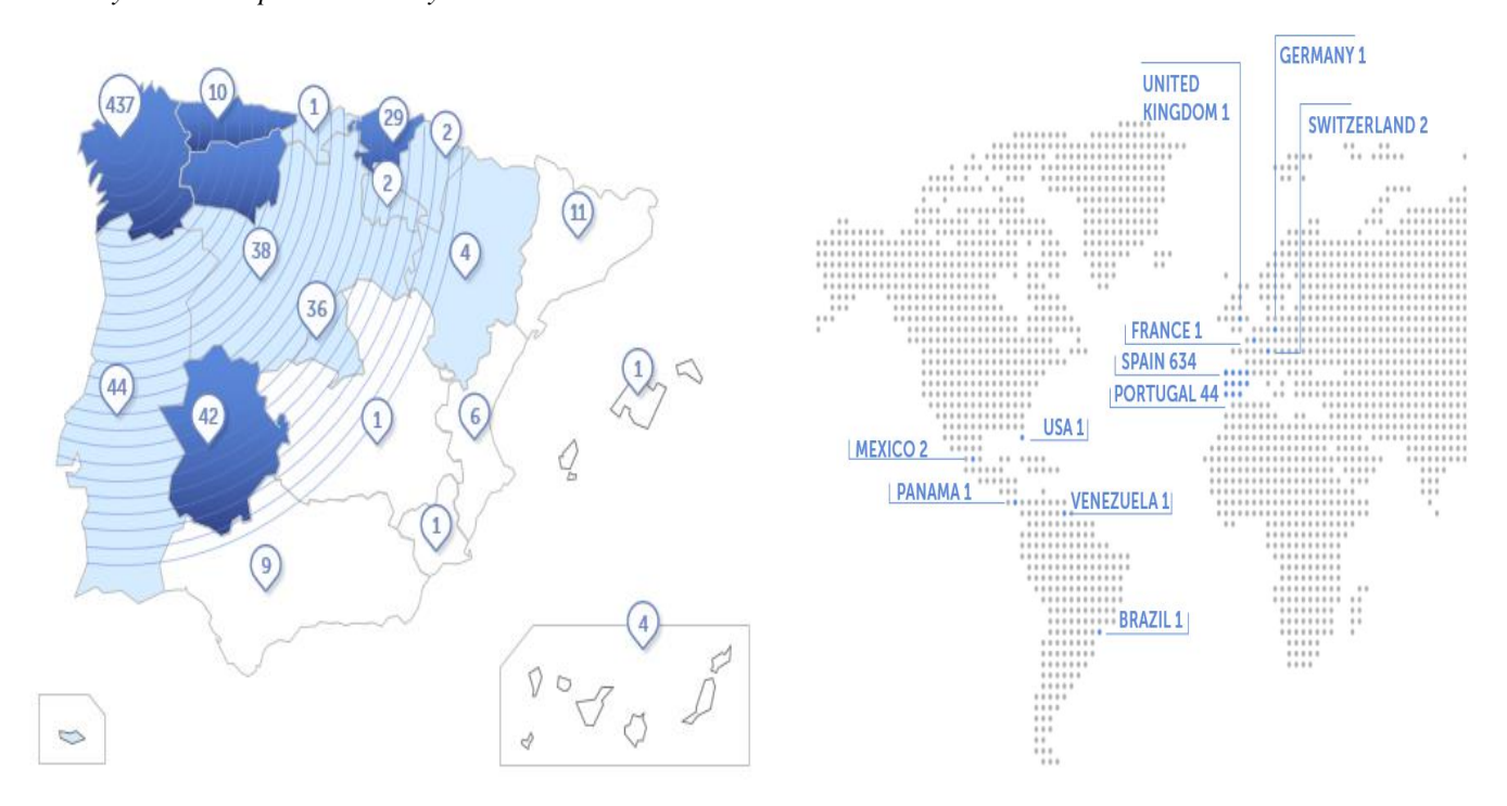
* Mexico includes Sentir Común SOFOM (Sociedad Financiera de Objeto Múltiple).

In addition, the presence of ABANCA in the Iberian market is complemented by a presence in the international markets through two operational branches in Switzerland and Miami (as of 31 December 2021) and representative offices (France, the UK, Switzerland, Germany, Panama, Brazil, Mexico and Venezuela). Please also see "— History and development - History " above.