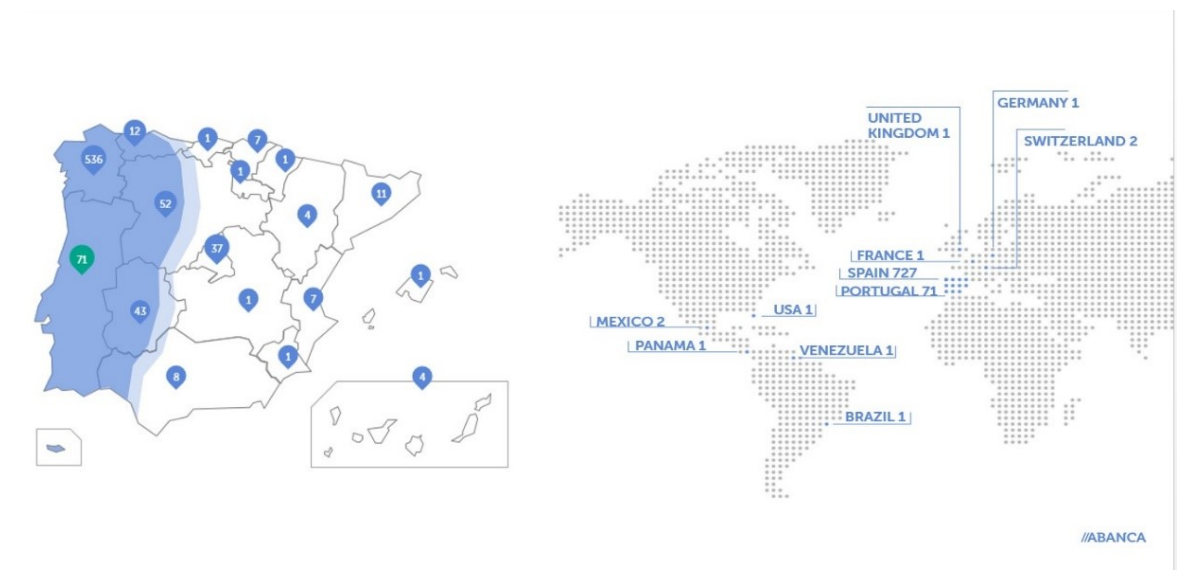
* Mexico includes Sentir Común SOFOM (Sociedad Financiera de Objeto Múltiple).

In addition, the presence of ABANCA in the Iberian market is complemented by a presence in the international markets through two operational branches in Switzerland and Miami (as of 31 December 2019) and representative offices (France, the UK, Switzerland, Germany, Panama, Brazil, Mexico and Venezuela). Please also see "— History and development - History " above.