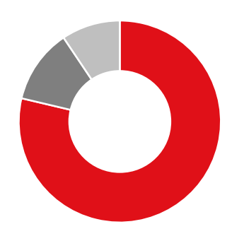
2013 Adjusted EBITDA