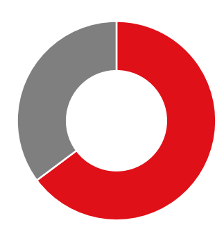
2014 Gross sales under banner